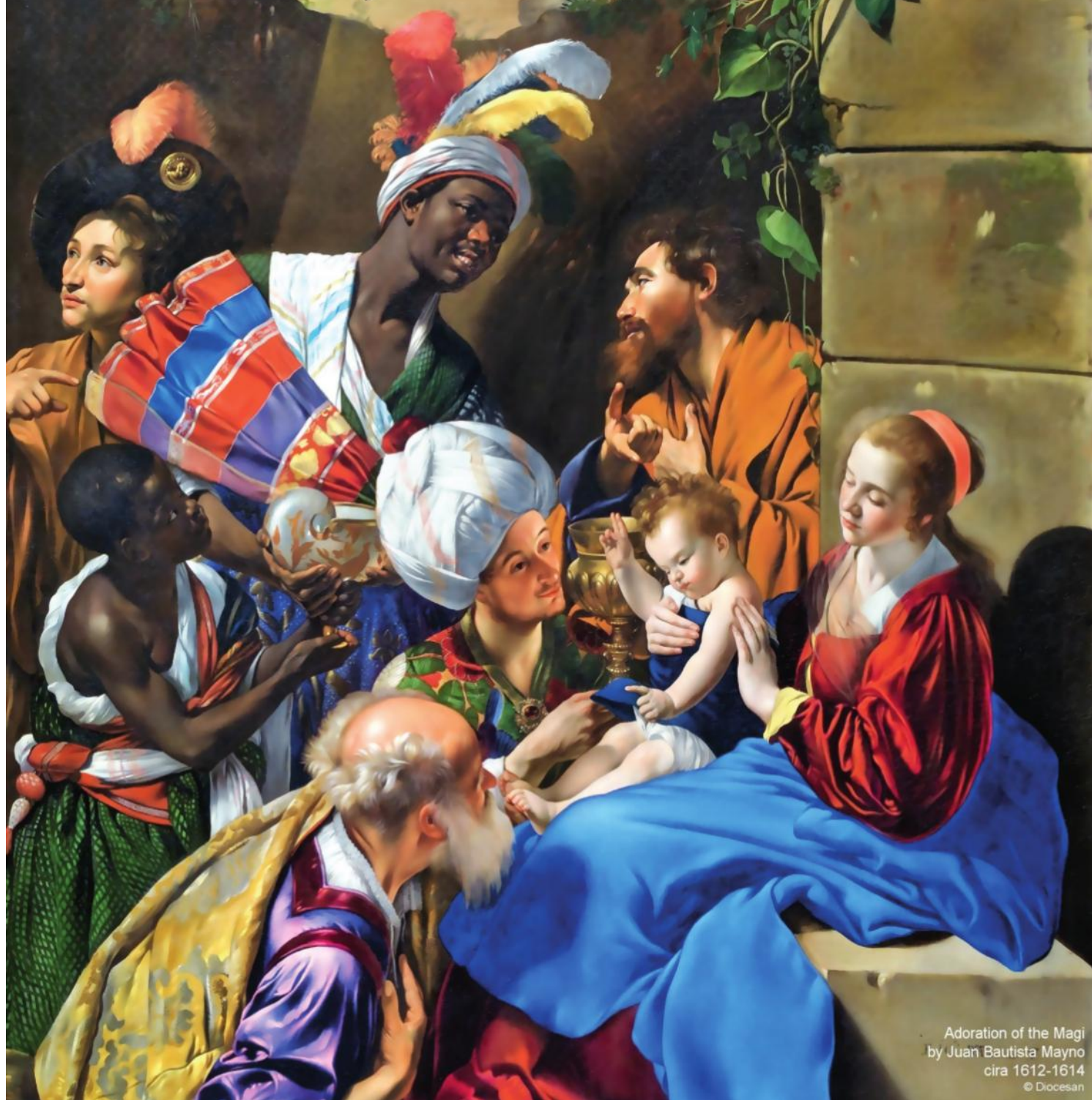
Adoration of the Magi by Juan Bautista Maíno cira 1612-1614